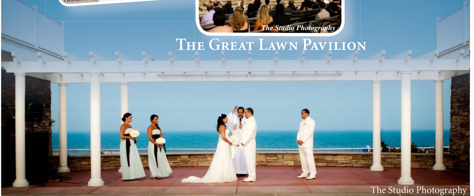
The Studio Photography