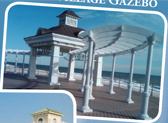
PIER VILLAGE GAZEBO