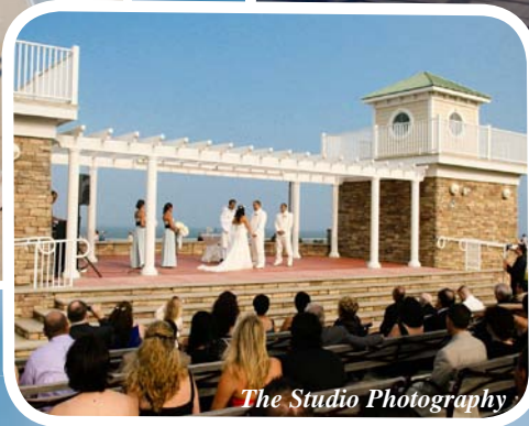
The Studio Photography